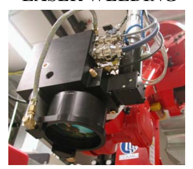
Remote Laser Welding